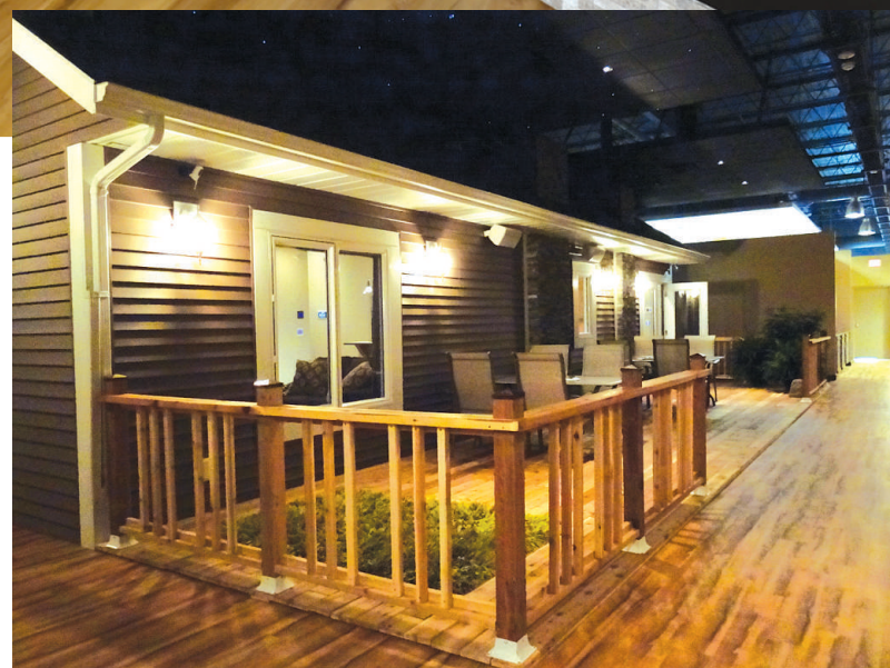
Exterior patio of Accurate's Demonstration home.

That leading-edge technology can even be applied to ensuites and bath-