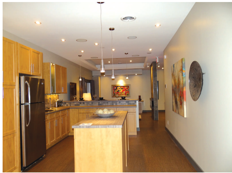
Interior of automated Demonstration home.